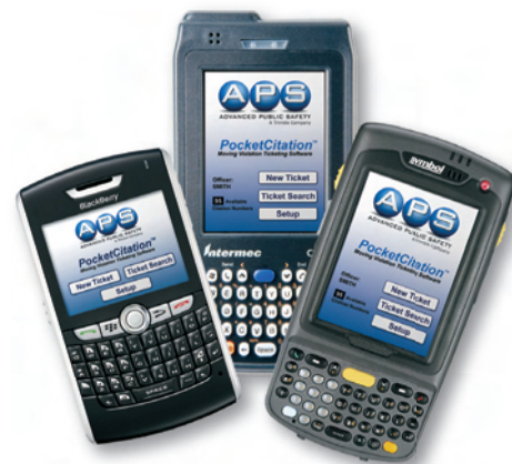
PocketCitation operates on any handheld device (ruggedized, durable, and consumer devices).